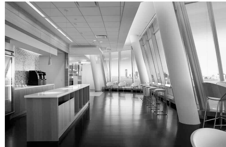
IAC/InterActiveCorp headquarters, New York. Building designed by Frank O. Gehry; interior architecture by Studios Architecture.