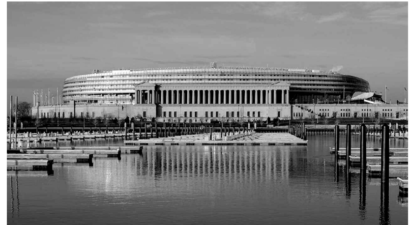
Soldier Field Renovation. Architects: Lohan, Caprile & Goettsch and Wood + Zapata.

Try to match your needs with a photographer’s strengths, professionalism and compatibility with your style. The right photographer for you is one who understands your design ideas and can communicate them visually to the wider world.