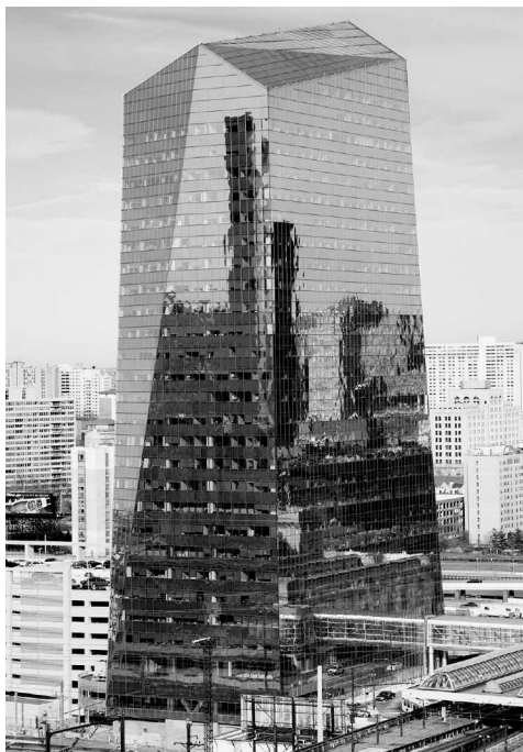
Cira Center, Philadelphia PA. Architects: Cesar Pelli Associates Architects and BLT Architects.

Besides these benefits to the architect and publisher, the publication can benefit the entire architectural profession and especially its students and emerging practitioners. Architectural designs are not created in a vacuum but within an evolving tradition