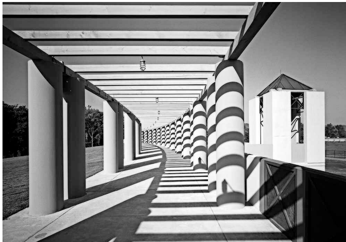
Riverbend Music Center, Cincinnati OH. Designed by Michael Graves.